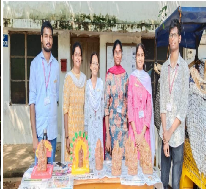
Green Ganesha Event