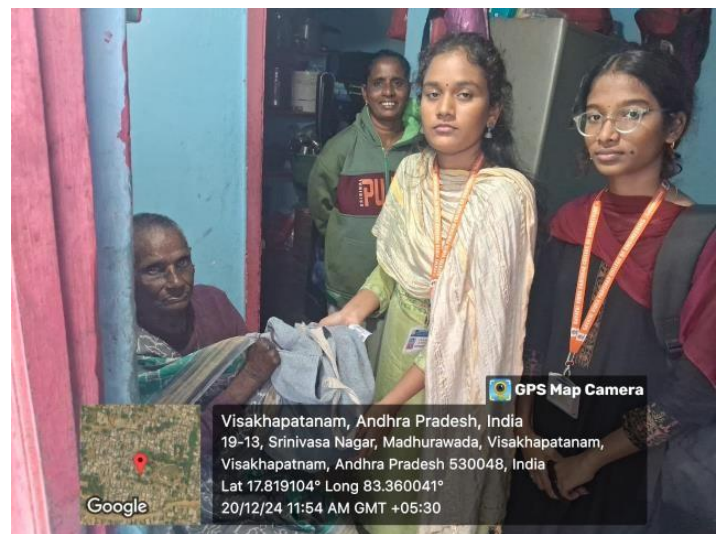
Distribution of Groceries