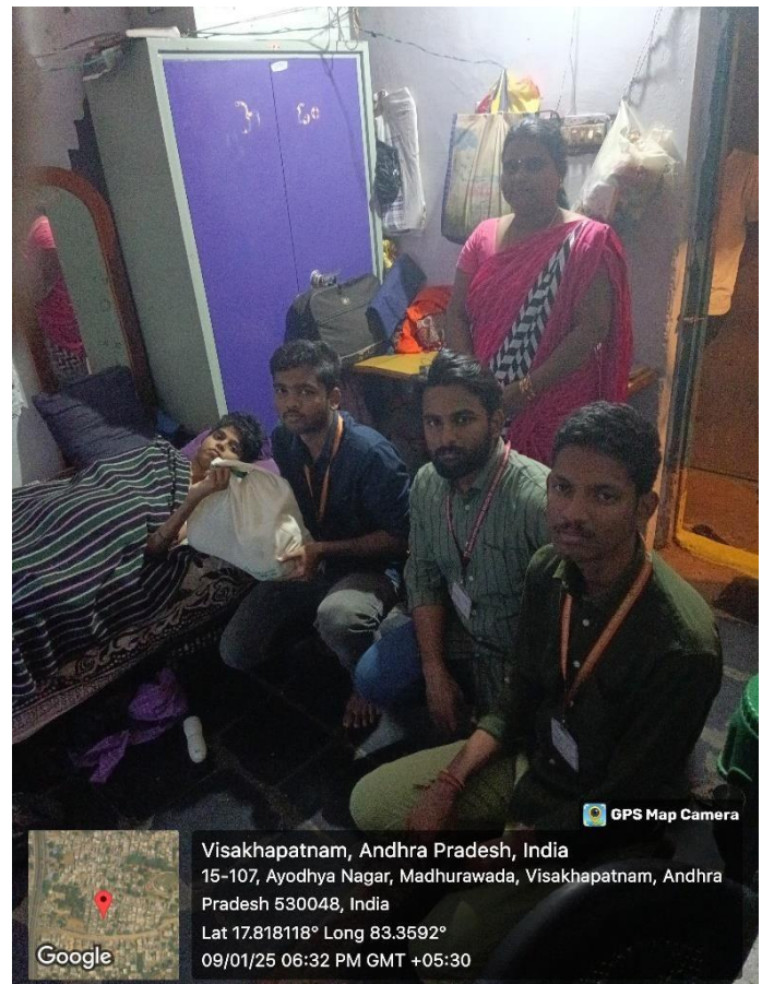
Distribution of Groceries