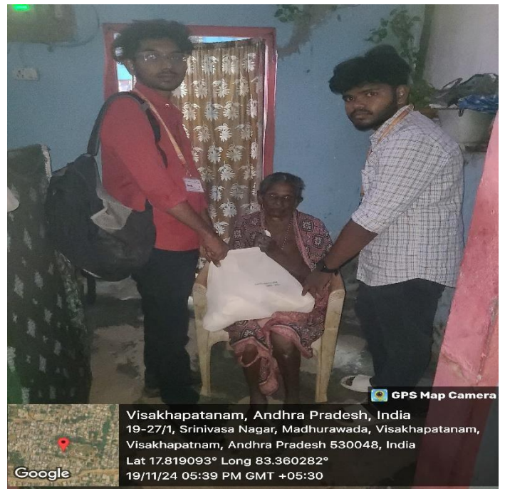
Distribution of Groceries